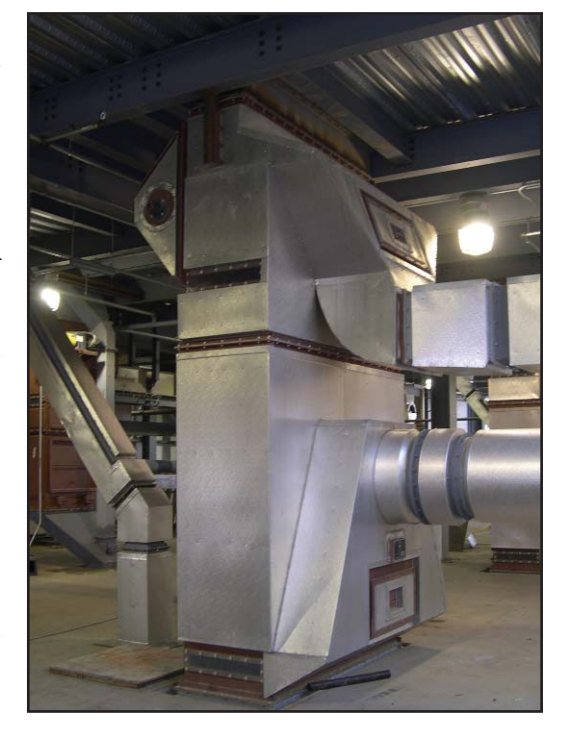
Crown Cascade Aspirator

The heavy duty feeder is designed to evenly and consistently spread the product across the entire width of the machine. The unit is designed to be choke fed, and when equipped with an optional level control and variable speed drive, provides a completely automatic feeding system.