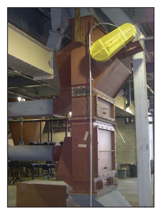
Crown Closed Loop Aspiration System.